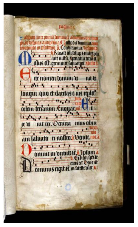
Antifonarium (winterdeel) voor de orde van de Wilhelmieten | Faber de Walincourt, Walter (illustrator). Source: VU University Amsterdam Library. CC0

Perhaps more importantly for Europeana's long-term ambitions, WP4 succeeded in ingesting digital objects into Europeana and began to find ways to utilise that content for different purposes. This is a significant shift in Europeana's direction, as previously it had only been able to deal with metadata. The KPI for content ingestion of 5m objects was met.